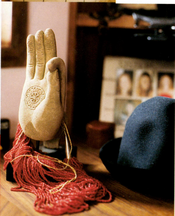
OPEN HOUSE Above: stone carving in the bedroom of a meditative mudra (hand gesture) symbolising wisdom and good fortune. Left: a tented canopy above the outside living area on the deck of the Lakota