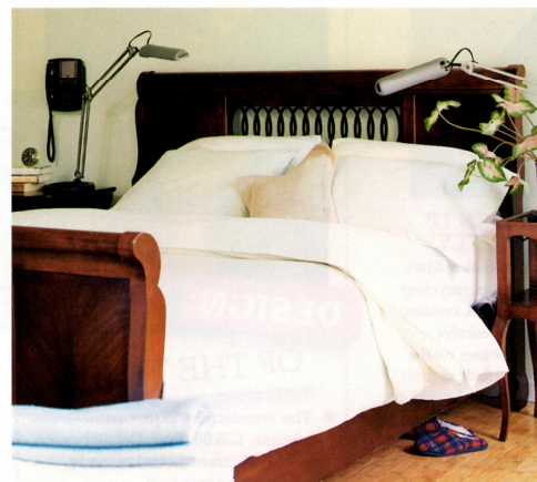
SEO CHIC Clockwise from above left: master bedroom in Danny Seo's Pennsylvania house. Vintage chest of drawers outside on the deck. Danny Seo

Another Seo devotee, Daryl Hannah has lived by her green beliefs for many years, growing her own fruit,